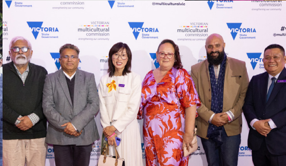
Multicultural Film Festival 2025