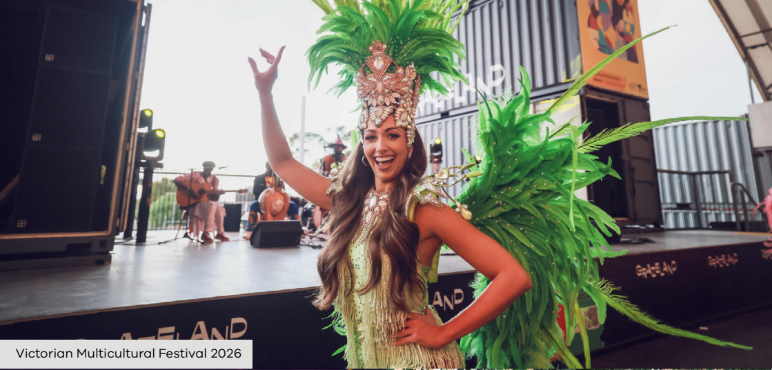
Victorian Multicultural Festival 2026