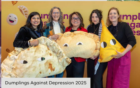
Dumplings Against Depression 2025