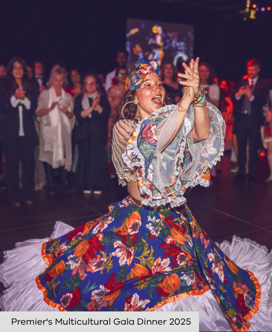
Premier's Multicultural Gala Dinner 2025