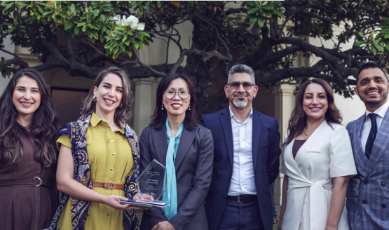
Victorian Multicultural Awards for Excellence 2025