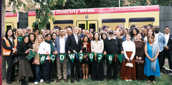
Cultural Diversity Week Media Launch 2026