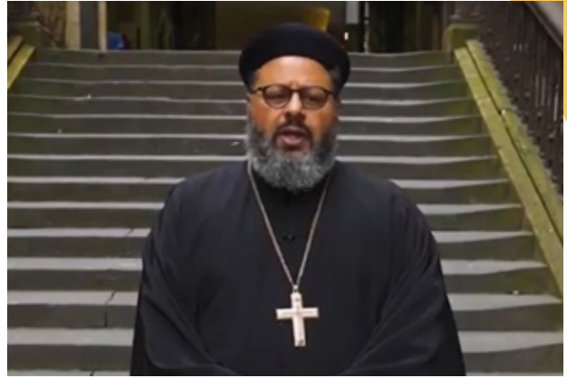
Multifaith Advisory Group members came together throughout the year to stand in solidarity on many important issues.

They also helped disseminate this vital information to diverse communities.