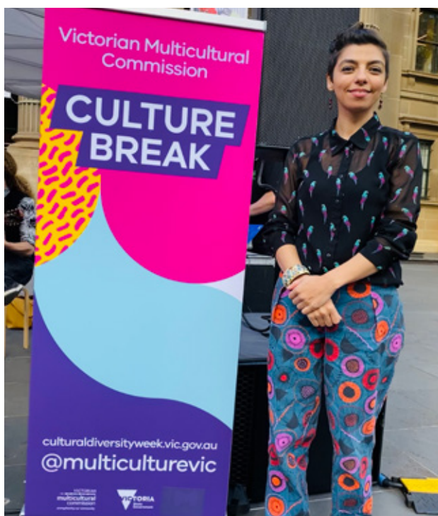
The VMC collaborated with Multicultural Arts Victoria for Cultural Diversity Week, creating 'Culture Break', a series of pop-up performances from diverse artists.