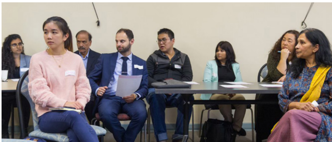
RAC members are the VMC's eyes and ears on the ground. They keep us up to date on issues arising in their regions.

Our eight Regional Advisory Councils (RACs) give us critical information and intelligence gathered directly from grassroots communities to inform the advice we provide to government.