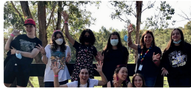
Avenue Productions Volunteers Team

The Avenue Productions Volunteers Team is a dynamic youth group empowering culturally diverse young people through the planning and delivery of creative events. By promoting inclusion, fostering intercultural dialogue, and amplifying the voices of youth, volunteers are building a more inclusive, vibrant and culturally aware community in Moonee Valley and beyond.