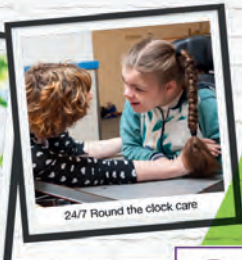
24/7 Round the clock care

DISABILITY & AGED CARE SERVICES NDIS SUPPORT COORDINATION