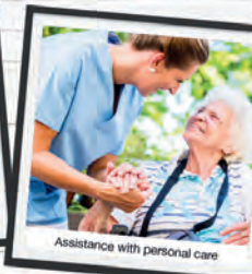
Assistance with personal care