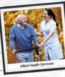
Allied Health Services