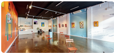
Walker Street Gallery and Arts Centre, City of Greater Dandenong

Walker Street Gallery and Arts Centre (WSG) is Dandenong's hub for contemporary art. WSG's latest project, HOME24, is a transformative exhibition that celebrates refugee and asylum seeker artists. By encouraging intercultural dialogue, WSG promotes social cohesion through art, culinary experiences and collaborative events that connect the multicultural community in Dandenong.